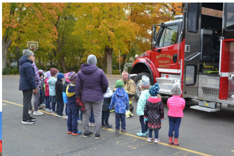
Fire Station Visit for Preschool & Kindergarten